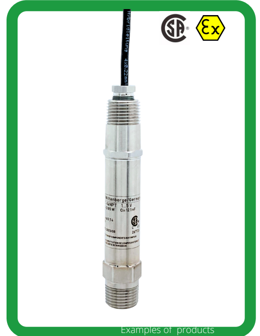
Examples of products